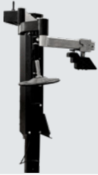
HPX-5 (for Megamount15)