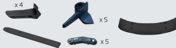
Set of plastic protections