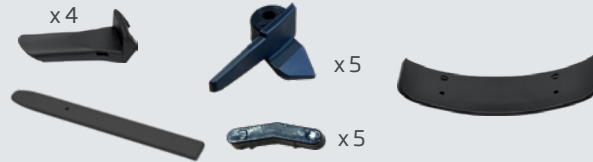
Set of plastic protections