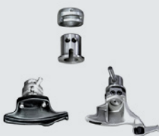
Quick interchangeable mounting head system, composed by adaptors and 2 mounting heads (one in plastic and one for raised spokes)