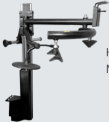
HPX-WS (for Megamount30)