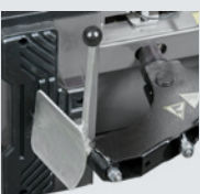
Bead breaker blade for motorcycle wheels

3-Phase motor version: 0.8 - 1.1 kW 400V/50-60 Hz/3ph (2 speed) - 7-14 rpm