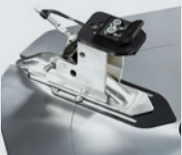
Set of 4 jaws for bike wheels with 6"-23" rim