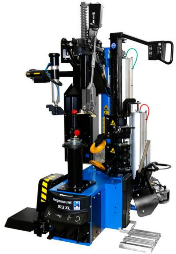
With option wheel lift.